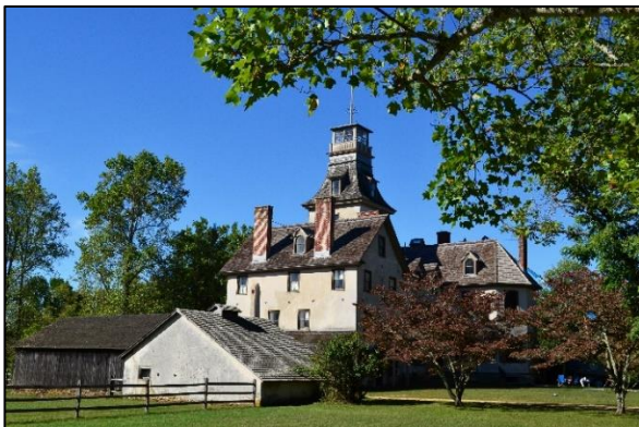
Above: The 37-room Batsto Mansion is an iconic, historic landmark located in Whitesbog State Forest.

https://www.facebook.com/whitesbog.preservationtrust/