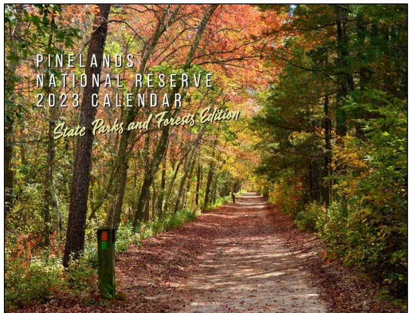
Above: The front cover of the 2023 Pinelands National Reserve wall calendar features a photo of fall foliage flanking a hiking trail at Double Trouble State Park.

Bass River State Forest (office) 762 Stage Road Bass River Township, NJ (609) 296-1114